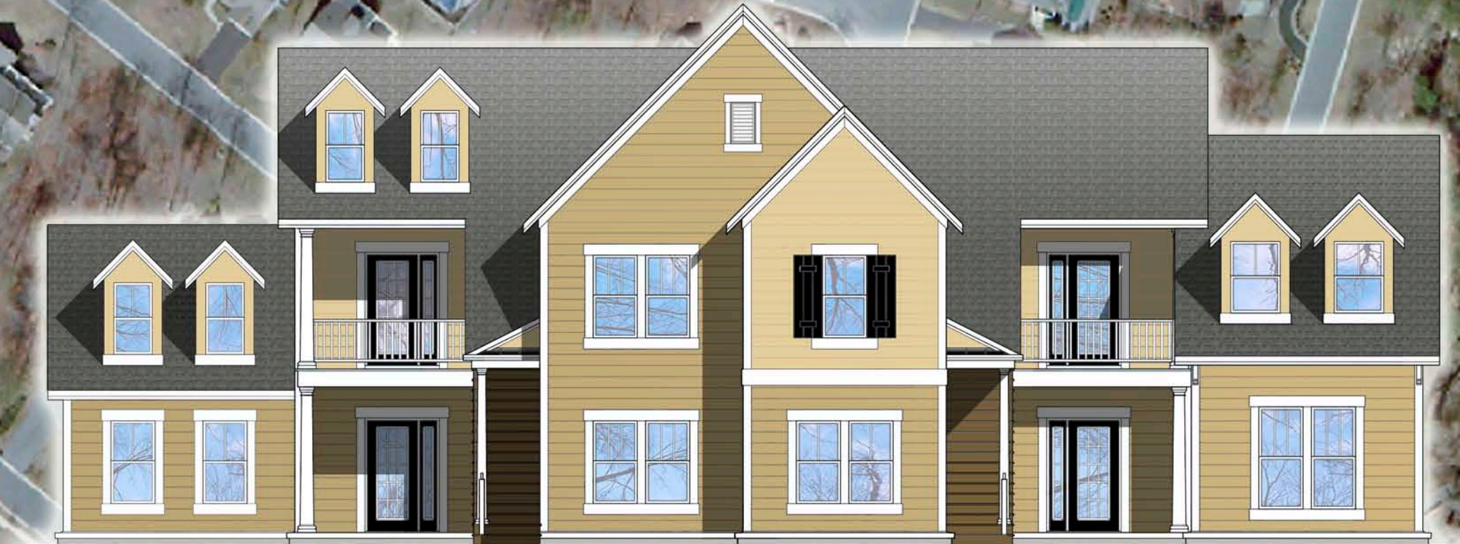
STACKED TWIN MEDIUM DENSITY ALTERNATIVE