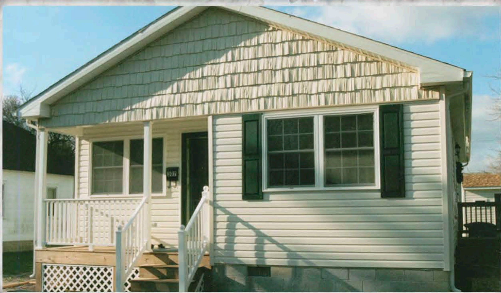
TYPICAL SINGLE FAMILY RANCH STYLE HOME